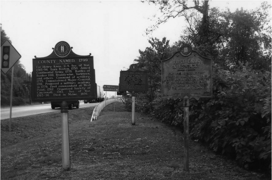
These markers are virtually stacked to the side of a busy highway outside of Barbourville.