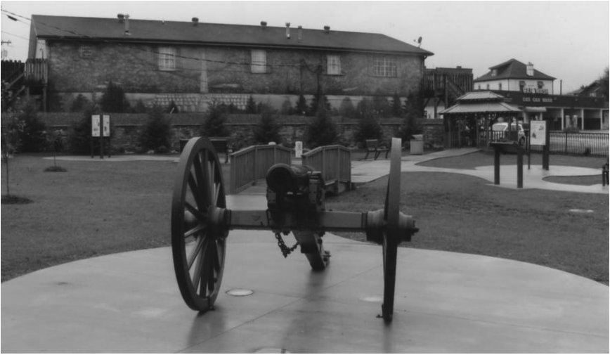
The Barbourville Civil War Interpretive Park.