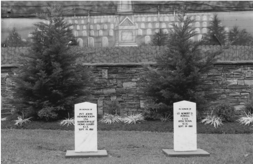
These headstones honoring two of the casualties of the battle of Barbourville, the first combat deaths in Kentucky, are located in the Barbourville Civil War Interpretive Park.

The modern city of Barbourville contains a population of approximately 3,600 people. As with many towns across the nation, Barbourville could greatly benefit from the economic opportunities offered in taking advantage of the park and resources the area offers. The groundwork for both preservation and monetary gains has been laid. The willingness and continued devotion of interested townspeople to properly utilize these will determine the success of the efforts previously enacted.